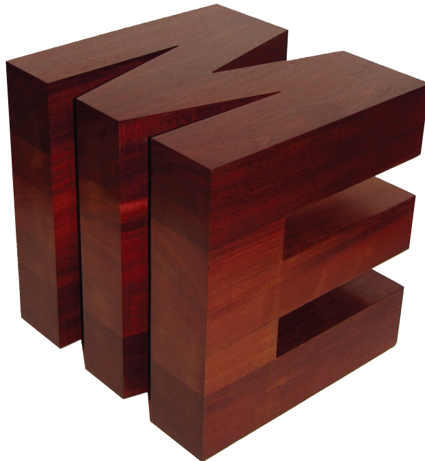
Me Block , 1990-91, wood, brass, edition 9/40, 14 \frac{1}{4} x 12 \frac{1}{2} x 13 \frac{1}{2} in. Collection of Gerald Mead, Buffalo, NY.