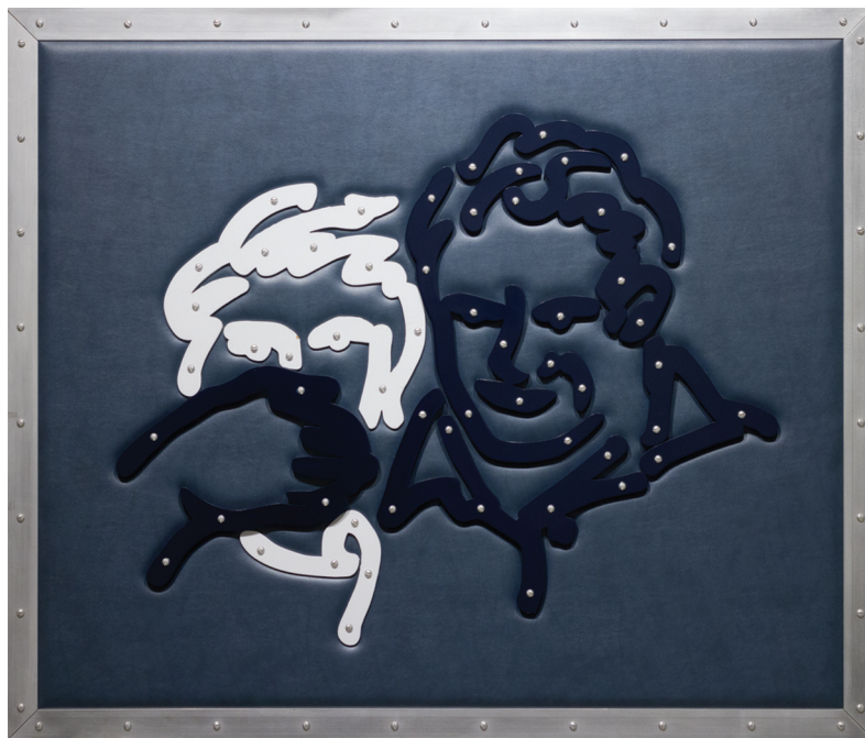
Censored: Boss Attack , 1983, aluminum, vinyl and lacquered board, 43 \frac{1}{2} x 54 \frac{1}{4} x 2 in. Collection of Steven Biltekoff and Cecile Biltekoff.