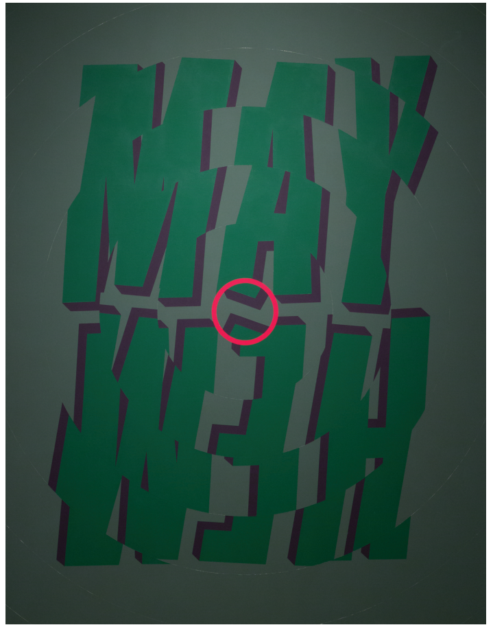
Mayhem , 1988, Flashe on canvas, 90 x 70 in. Collection of the Burchfield Penney Art Center, Anonymous gift, 2008.