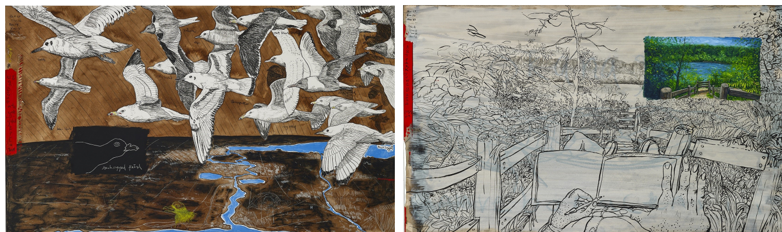
Image Credits: (cover) (detail) Biological Regionalism: Artificiality of the Niagara Falls , 2022, Niagara River water, walnut ink, oils, pastels, and charcoal; (above) Biological Regionalism: Water of the Niagara River , 2022, Niagara River water, walnut ink, oils, acrylic marker, pastels, gouache, and charcoal.

"It is crucial to inform the public about the importance of the Niagara River in America's cultural and natural heritage and the challenges that the river faces."