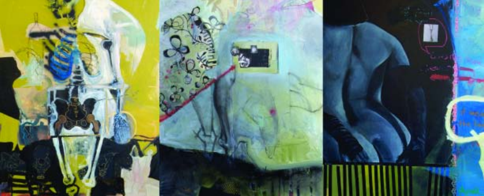
(from left to right): Because I love you , 2007, oil, oil stick, duct tape on canvas, 60x48 in.; I'll get my hair done after PT and before OT , 2007, oil vintage paper, pen, charcoal, electrical tape on canvas, 60x48 in.; Just one more thing , 2007, oil, vintage paper, spray paint on canvas, 60x 48 in.; Do you know Jim? I do , 2007, oil, spray paint, oil stick, x-ray film on canvas, 60x48 in.; Just put my socks on! , 2007, oil, spray paint, paper on canvas, 60x48 in.; The dog ate it , 2007, oil, spray paint, oil stick, duct tape on canvas, 60x48 in.