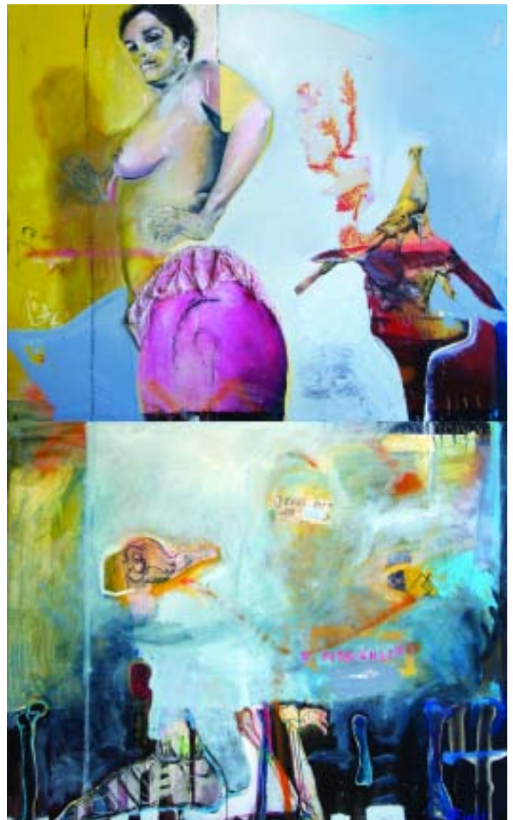
Stillness , 2007, multi-media on canvas, 120x72 in.