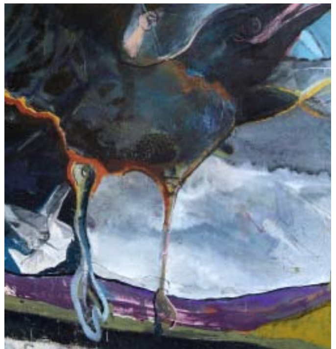
Sweet volatile Saoirse (detail), 2007, oil on canvas, 65 x 84 in.

"It was as if I had plummeted off of a safe peak, was rocketing around a sharp corner, and eventually as if I was climbing a sharp track without being able to see what might be on the other side. It was a rollercoaster ride. I hope you enjoy this part of the ride with me."