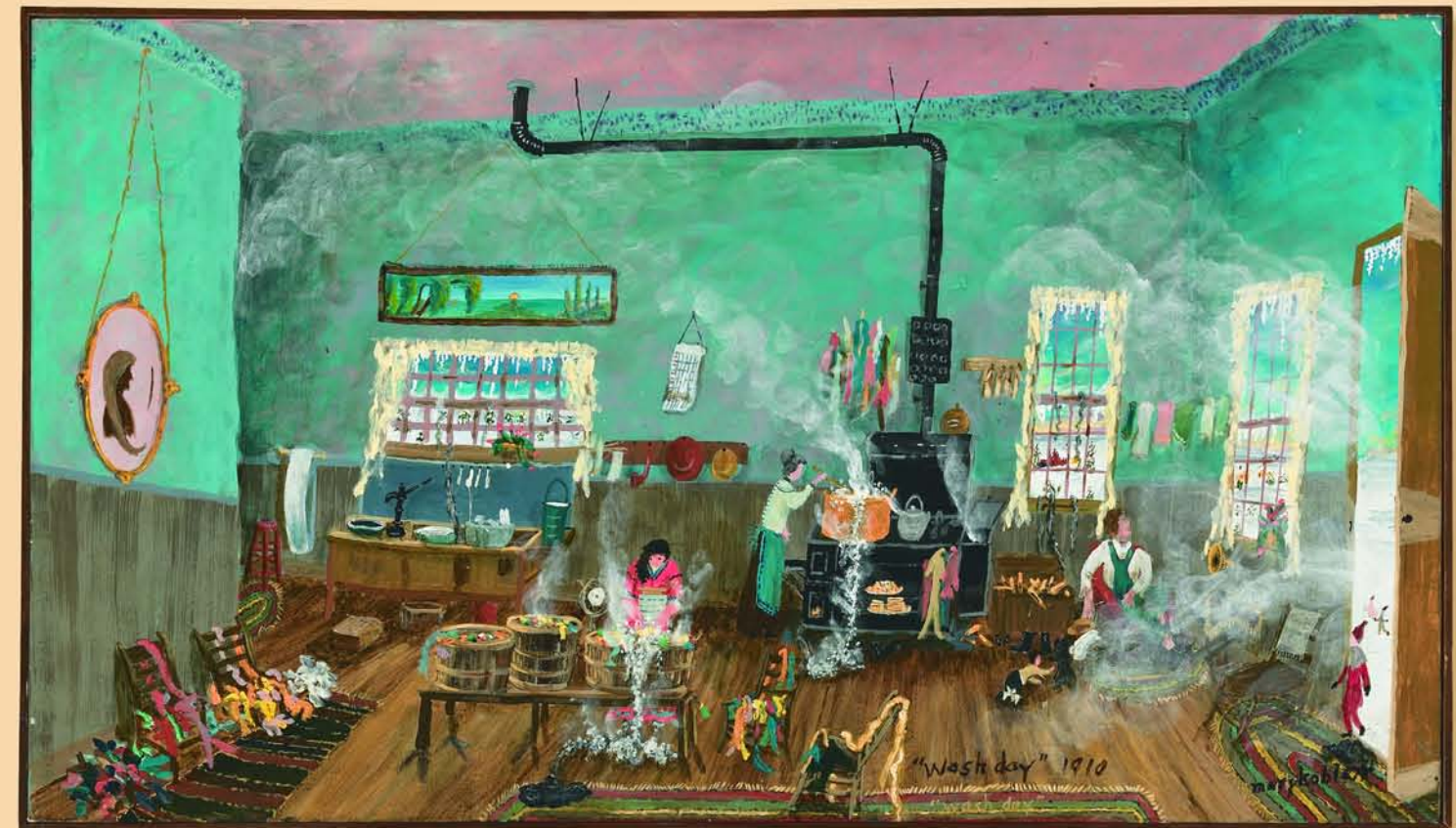
Wash Day 1910 , ca. 1960-75, acrylic on canvas.