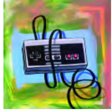
Controller 3, 2009, mixed media on canvas 12x12 inches.

Ever fearful of the pigeon-holing effects artists experience Holt employs a menagerie of artistic styles, materials and influences to stay well ahead of his own "stylized demise." He states, "My deliberate attempt to switch up influences and style is mirrored in my amusement of channel surfing." He is notorious for periodically working 14-hour days of what he refers to as "sporadically creative periods." Holt's fortitude finds him working