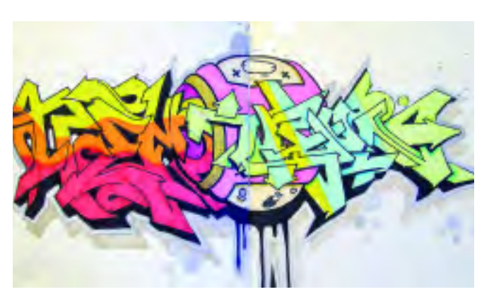
\textit{Untitled} \ (\text{Sketch}), \ 2007, \ \text{ink on paper/Moleskin sketchbook}, \ 5 \, \text{x} \, 9 \ \text{inches}.

He is one of the most active yet underexposed artists in western New York. From small pencil illustrations and mixed media paintings to large-scale spray painted murals and digital video projects, Tom Holt's choice of material and subject matter are as varied as his considered choice of exhibition locations. His anthology of sketchbooks occupies a corner of his west side studio, abandoned mementoes of his thought process. They are, in fact, an extensive record of his uncompromising daily ritual as a visual diarist. Not only a record of