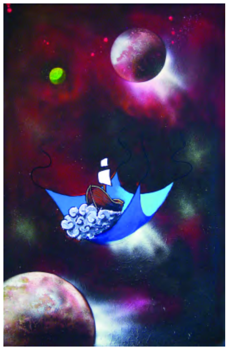
Sailing, 2009, mixed media on canvas, 29.5 x 19 inches.