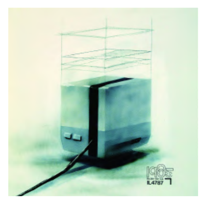
1985, 2009, mixed media on panel 16 x12 inches.