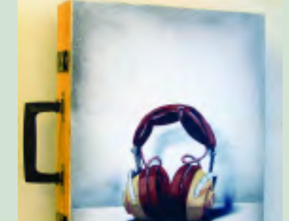
Listening, 2009, mixed media on briefcase