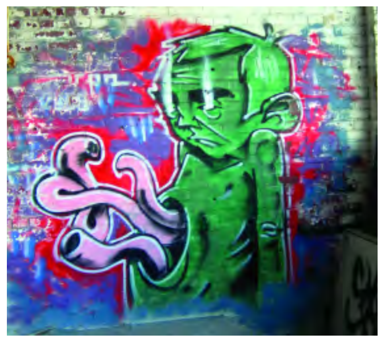
Untitled, n.d., spray-paint on brick.