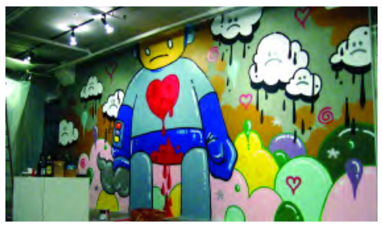
Love Life, 2004, mixed media on wall, approx 170 x 480 inches.