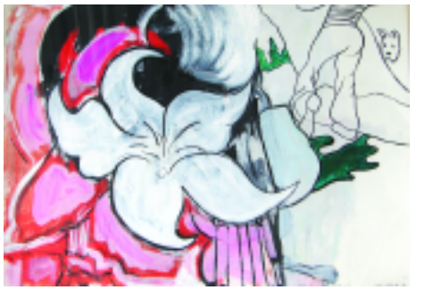
Flower, Boy, Dog, 1987, acrylic on paper, 25 x 33 in.

In 1982, Huntington left his position as Buffalo Courier-Express art critic to become visual arts director at Artpark. Inspired by his new environment, he moved from pure abstraction to