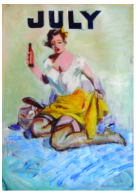
July: The Spilled Ketchup, 1997, acrylic on paper, 43 x 31 in.