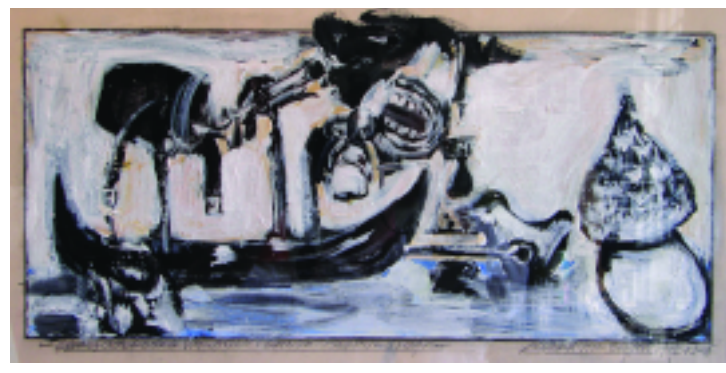
(Rube) Goldberg Variation: Canoe Propulsion, 1992+2005, acrylic & pencil on paper, 25 x 33 in.

The cartoons evolved into overtly satirical work with the ( Rube ) Goldberg Variations . Rube Goldberg (1883-1970) was a Pulitzer Prize- winning cartoonist, a sculptor, and a writer whose famous "inventions" depicted fantastically difficult ways to accomplish simple, everyday tasks. Hybrids of machine movements with flexing elements that relied on unlikely actions and reactions—think The Mousetrap Game released by Ideal in 1963—