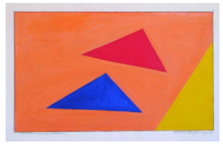
On Comes the Don (Giovanni), 1973 + 1993, acrylic on paper, 25 \times 33 in.

Toward the end of the 1960s, Huntington began working on large format canvases pieced together with a central canvas framed by adjoined, upward-facing U-shaped canvases. The image in these