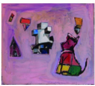
Thinking Dog, 1987, acrylic on paper, 30 x 33% in.