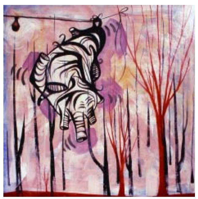
Caffeine, Every Morn, 2006, oil and acrylic on board, 24 x 24 in. Collection of Carey Maines, Buffalo, NY.