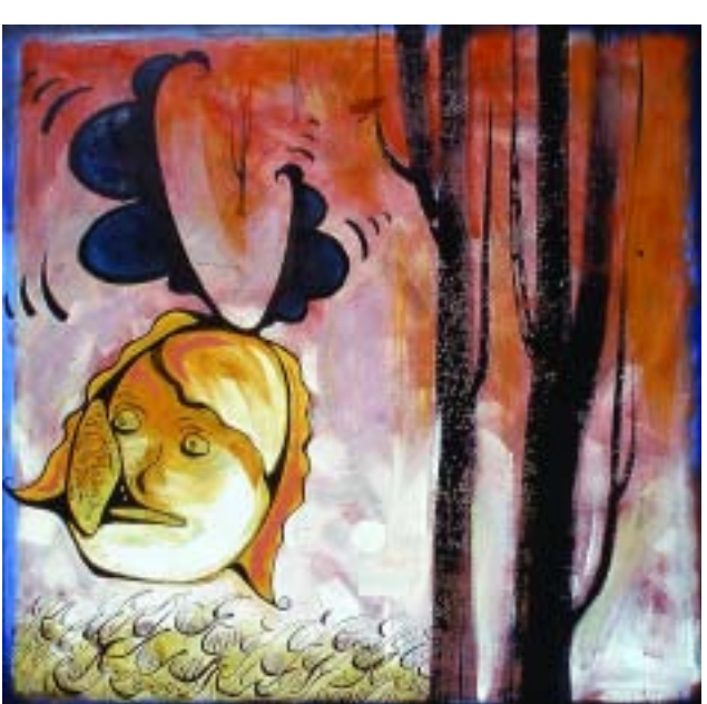
Four Page Letter, 2006, oil and acrylic on board, 24 x 24 in. Collection of Carey Maines, Buffalo, NY.