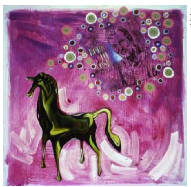
Born to Loose, 2006, oil and acrylic on board, 24 x 24 in.