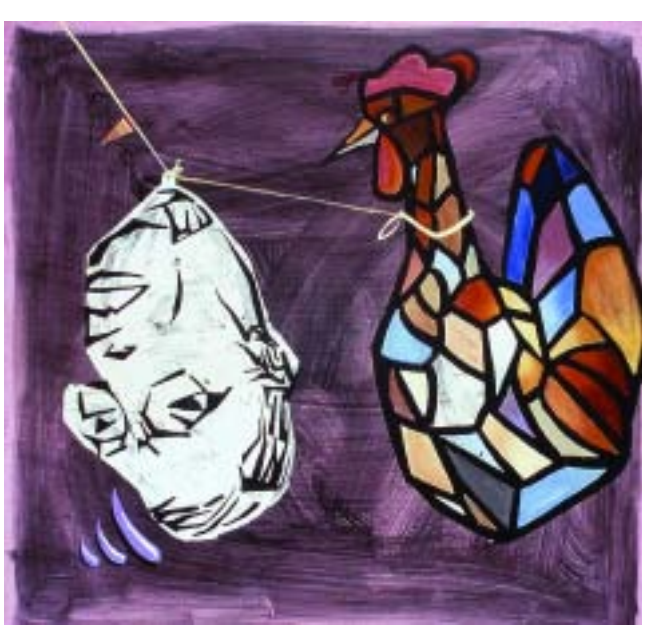
lgor vs. Tiffany, 2006, oil and acrylic on board, 24 x 24 in.