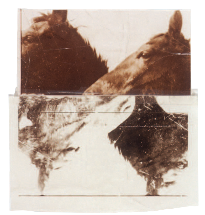
Starn Twins (Doug and Mike Starn), Horses, 1986/1993, photographic collage with cellophane tape