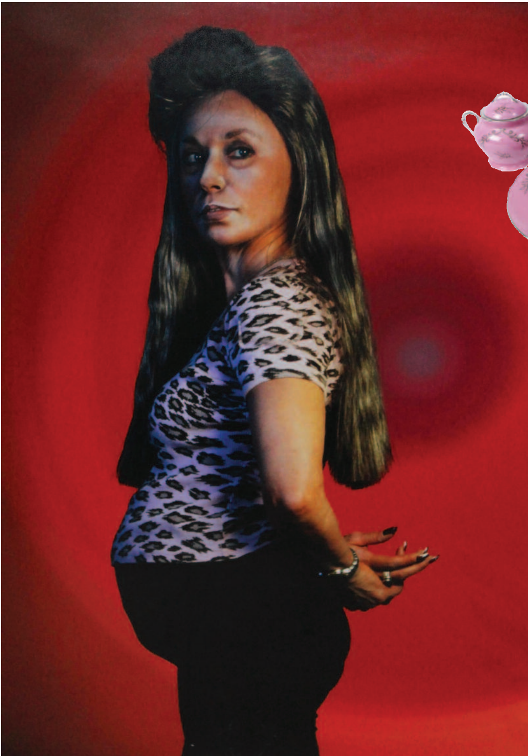
Untitled (Pregnant Woman) , 2002/2004, Chromogenic color print, edition 219/300. Collection of Gordon Ballard, Buffalo, NY.