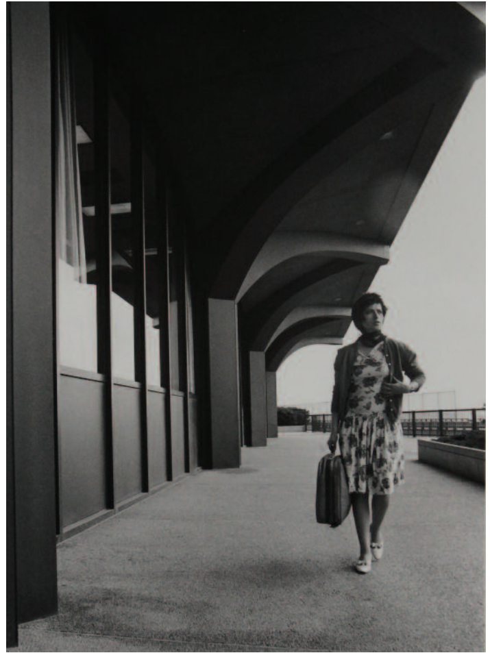
Untitled (Under the WTC) , 1980/2001, gelatin silver print, edition 80/100. Collection of Gerald Mead, Buffalo, NY.