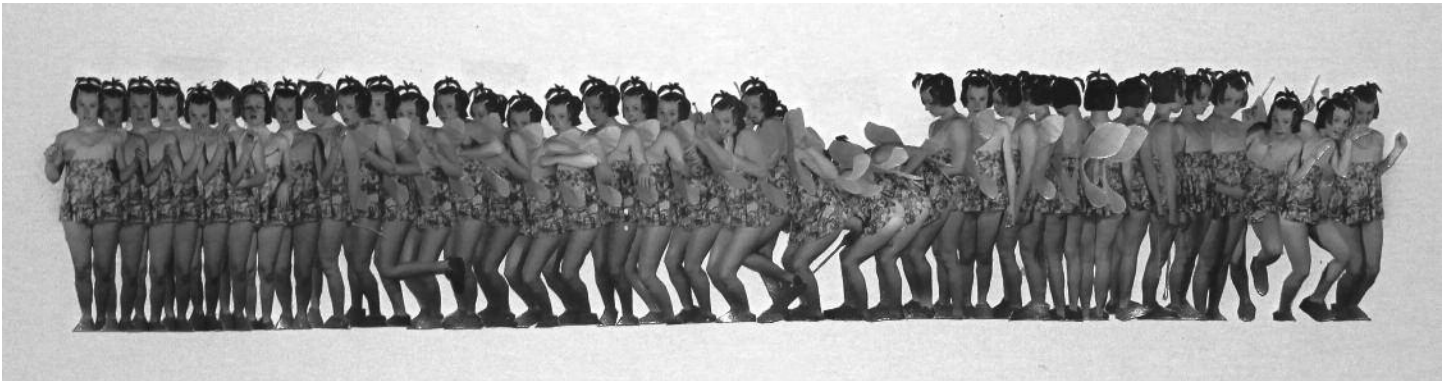
Image credits (from top to bottom): Untitled F (1 of 2) and Untitled F (2 of 2) [Doctor and Nurse], 1980/1987, diptych, gelatin silver prints, edition 40/ 125. Collection of Jack Edson, Hamburg, NY; Scale Relationship Series (Version III), 1976, 37 black and white cut-out photographs, mounted on board, unique. Castellani Art Museum of Niagara University Collection. Gift of Savino Nanula, 1979.