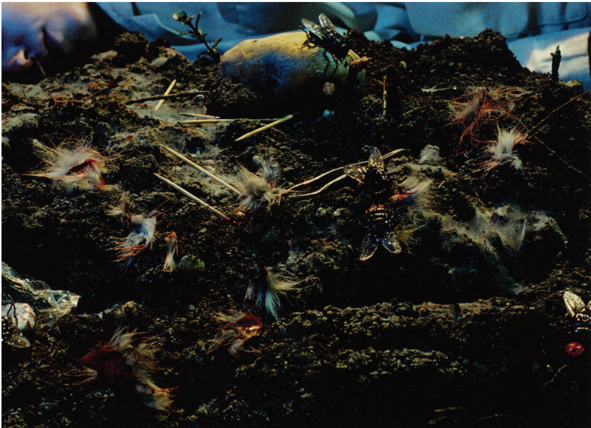
(Clockwise from top left): Untitled (Baby Doll with Mask), 1987, Chromogenic Color print, edition 52/125. Collection of Gerald Mead, Buffalo, NY; Untitled (Mrs. Claus), 1990, Chromogenic color print, unlimited edition. Collection of Gerald Mead, Buffalo, NY; Untitled #173 , 1986, color photograph, edition 1 of 6. Castellani Art Museum of Niagara University Collection. Gift of the Castellani Family, 2013.