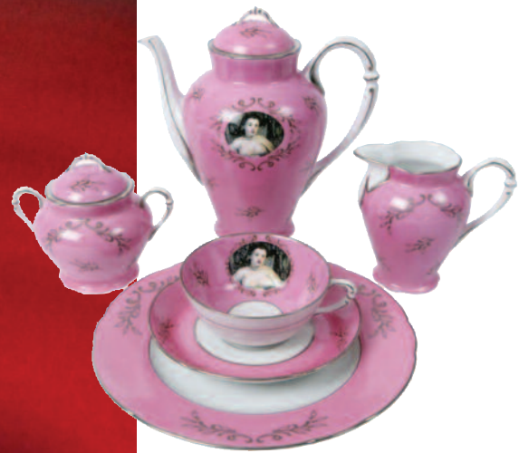
Madame de Pompadour (née Poisson) , 1990, Porcelain, edition 26R/75. Collection of The Schein-Joseph International Museum of Ceramic Art, Alfred University, NY, 2000.127-130,136. Museum purchase, Corsaw Collection.