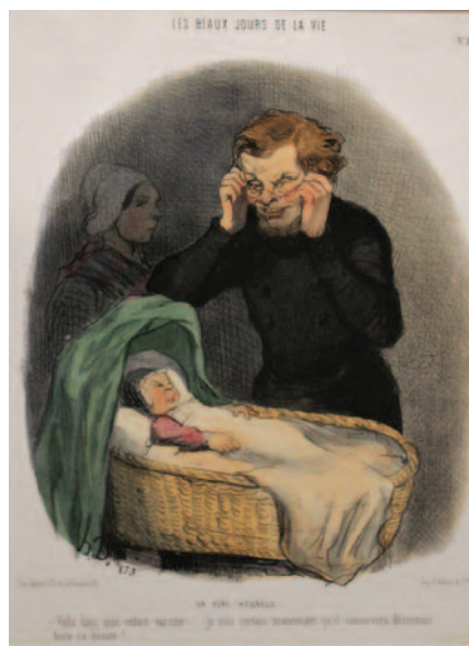
Honoré Daumier, Un Père heureux. Voila donc mon enfant vacciné...je suis certain maintenant qu'il conservera désormais toute sa beauté!... from Les Beaux Jours de la Vie (The Best Days in Life) , 1843-1846, hand colored lithograph, 12½ x 9½ in. Castellani Family Collection.