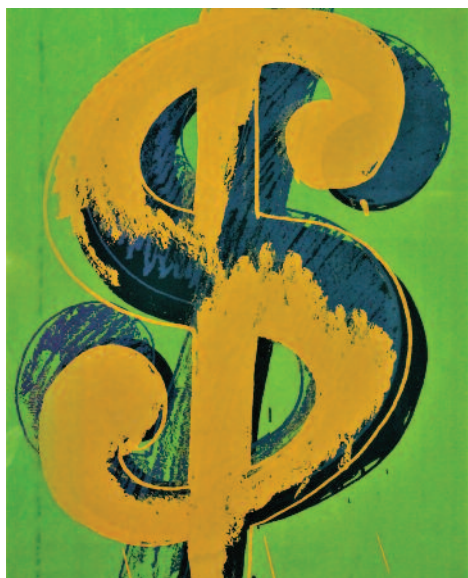
Andy Warhol, $1 , 1982, silkscreen on Lenox Museum Board, (no edition number noted), 19½ x 15½ in. Gift of the Andy Warhol Foundation, 2014.