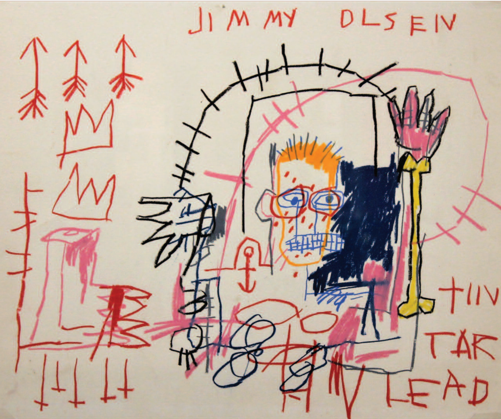
Jean-Michel Basquiat, Jimmy Olsen , 1981, crayon and oil stick on paper, 18x24 \frac{1}{4} in. Castellani Art Museum of Niagara University Collection, Gift of the Castellani Family, 1999.

CASTELLANI ART MUSEUM OF NIAGARA UNIVERSITY